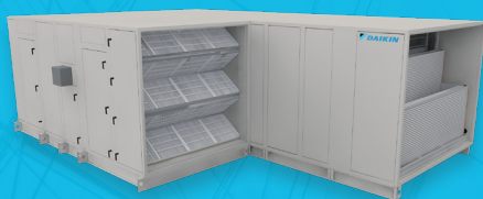
Vision® Indoor Air Handling Systems

* Details found on the GSA website at https://www.gsa.gov/node/81916 , under Sub-Section 5.9