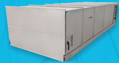
RoofPak® Rooftop Systems

For more information about UV lights and our complete line of air handling systems, contact your local Daikin Applied Sales office or visit www.DaikinApplied.com to find an office near you.